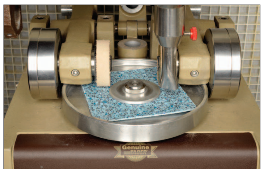
Fig. 2: Abrasion testing in progress.