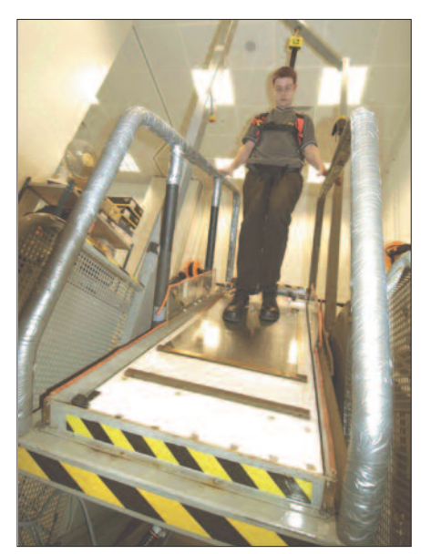
Fig. 4: The Ramp test involves a person with work boots walking over a flooring sample on an inclined ramp in the presence of an oil contaminant.

It is important to remember that a clean floor is a safe floor, and to follow the floor care guidance offered by your chosen flooring manufacturer. The development of protective maintenance enhancements such as Polyflor's Polysafe PUR polyurethane reinforcement means