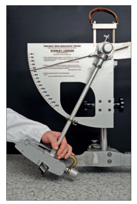
Fig. 3: The Pendulum test method is recommended and preferred by the HSE to assess the dynamic coefficient of friction of a floorcovering, achieved by swinging a dummy heel over the floor surface to simulate a foot slipping on a wet floor.

The surface roughness of the flooring must be sufficient in order to penetrate the squeeze films created when there is a presence of wet contaminants between shoe sole and the floor that prevents solid